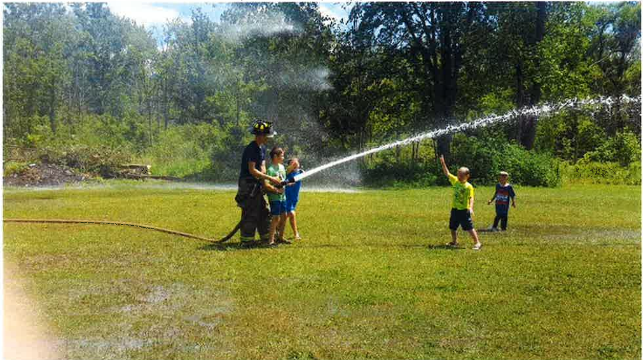
Below: FF Nielsen at Lake Side Camp Park Safety Days