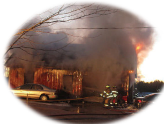
Solon Township Firefighters responding to a March, 2015 fire on Cedar Springs Avenue.