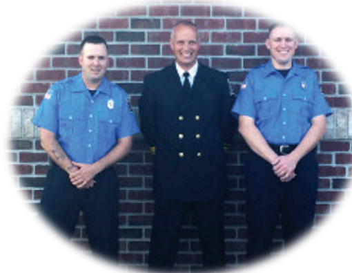
Solon Township Firefighters awarded badges after completing Michigan Fire Fighter's Council Firefighter I & II exam.

Join the Solon Township Fire Department as a paid on-call Fire Fighter or Medical 1st Responder or both.